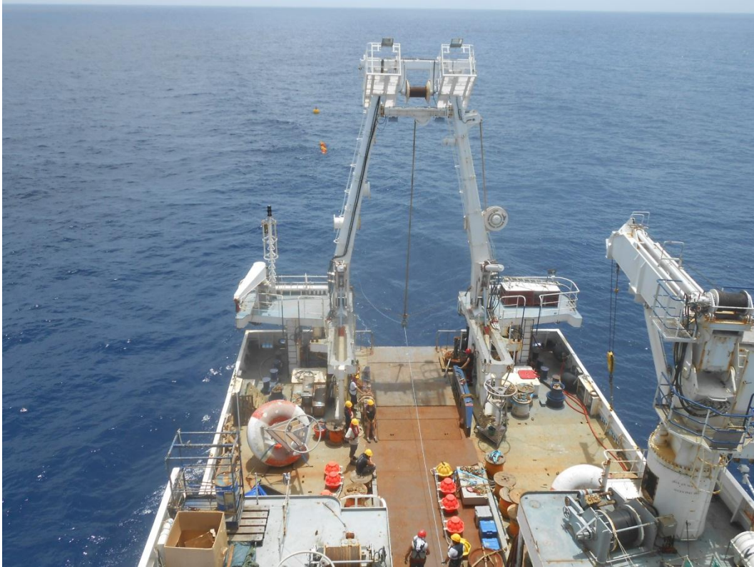
The ADCP mooring deployment (Courtesy: B.Bourlès, IRD).