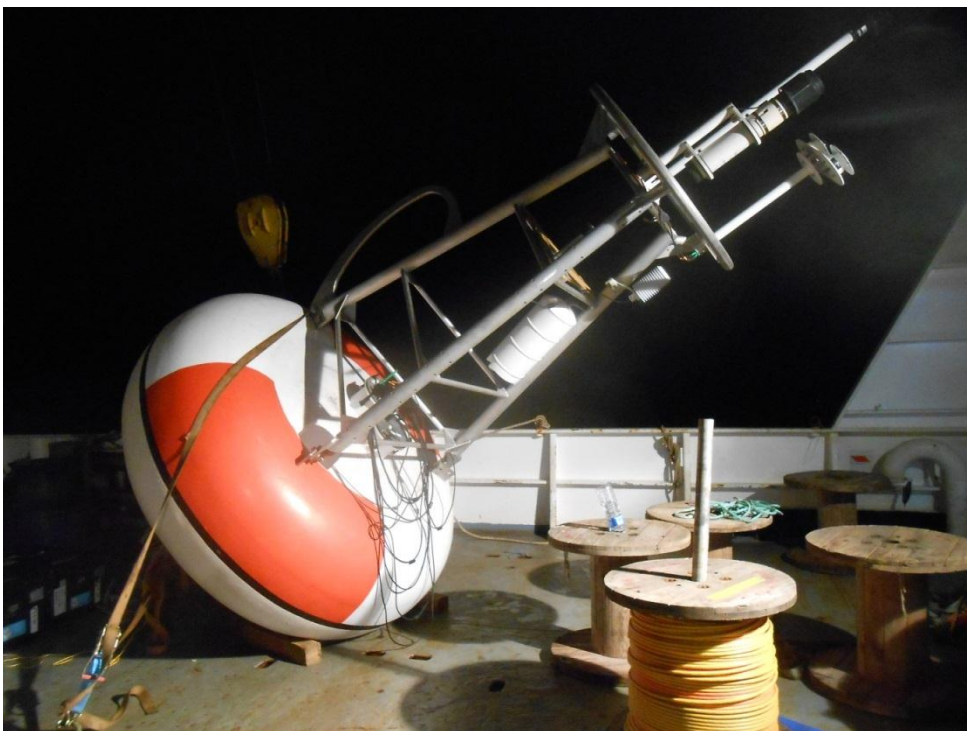
T-FLEX buoy before its deployment at 23°W-0°N (Courtesy: B.Bourlès, IRD).