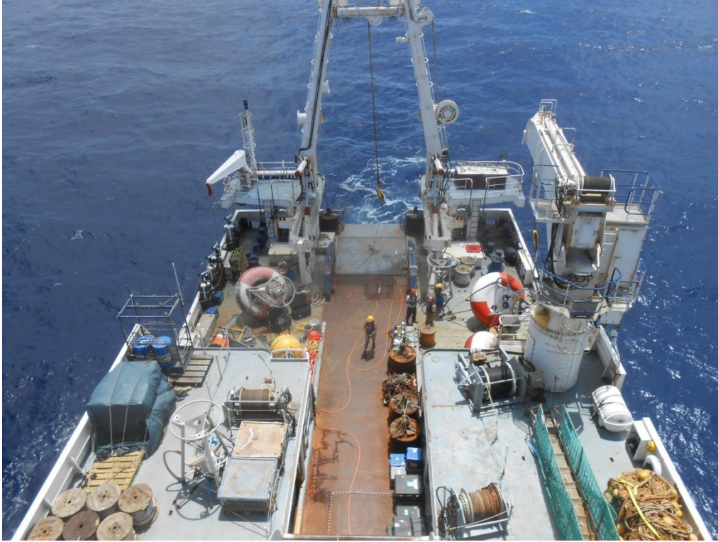
Last preparation of the T-FLEX buoy before its deployment at 10^{\circ}\text{W} - 10^{\circ}\text{S} and sensors installation along the 1 st 60 meters of the cable; the buoy of the left is the ATLAS just retrieved, the TFLEX is on the right (Courtesy: B.Bourlès, IRD).