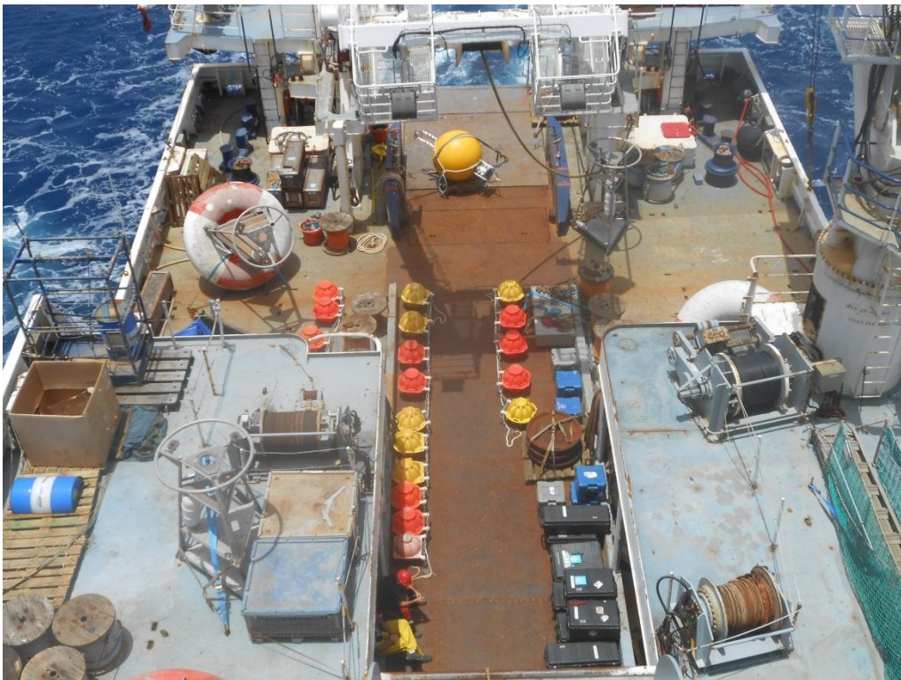
The ADCP mooring on the bridge before its deployment.